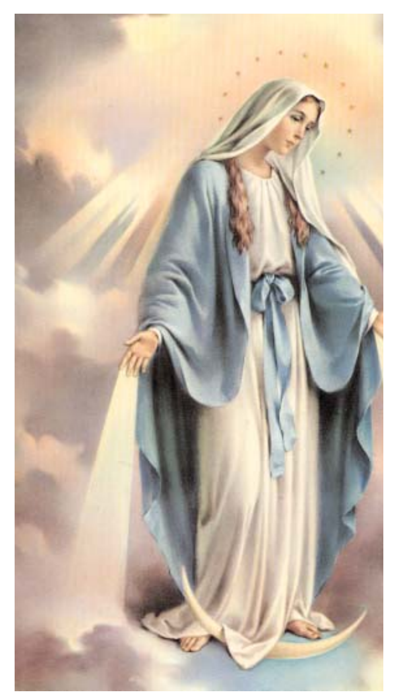
Mary Mediatrix of All Graces.

In this distressing and dramatic time of war against the Catholic Church and Christian Civilization, let our Holy Rosary be the sword of dazzling fire which will stop the stream of the "Red Sea" and will hasten the victory of Christ the King and of His Church. Amen!